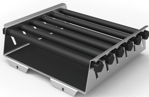
Funnel Attachment Platform (Cat. No. OS-FA)