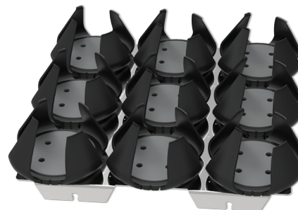
Plastic Platform for Plastic Clamps Flask Capacity of 9 x 250 mL or 9 x 500 mL, Clamps Sold Separately (Cat. No. OS-PBP)