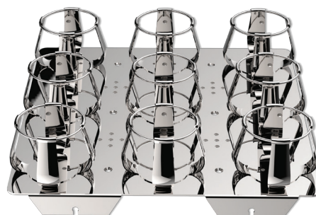
Stainless Steel Platform for Stainless Steel Clamps OS-SBP250: Flask Capacity of 9 x 100 mL, 150 mL, or 250 mL Flasks OS-SBP1000: Flask Capacity of 9 x 500 mL or 5 x 1000 mL Flasks Clamps Sold Separately