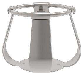
Stainless Steel Flask Clamps 100 mL Flask Clamp: OS-SC100 250 mL Flask Clamp: OS-SC250 500 mL Flask Clamp: OS-SC500 1000 mL Flask Clamp: OS-SC1000