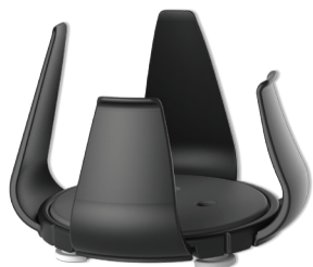
Plastic Flask Clamps 250 mL Flask Clamp: OS-PC250 500 mL Flask Clamp: OS-PC500